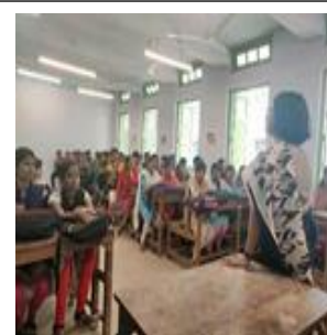
Observation of International Mother Language Day by the Department of Bengali and the Department of History