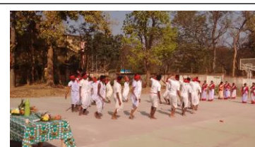
Bratachari and Yoga Camp

The college has its own playground, volleyball, badminton and basketball courts. The college also boasts of a State-of-the Art modern gym. The college holds its Annual Athletic Meet every year and various activities are held and encouraged among the students. The winners are felicitated. This is further extended into inter-departmental, inter-mural, inter-college and inter-district meets. At least three to four teams are fielded per year