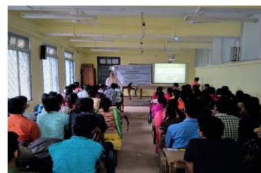
DBT Star Sponsored Workshop on Bioinformatics Programming organised by Dept. of Zoology