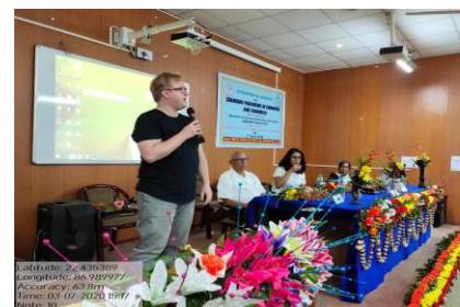
International Seminar jointly organised by the Deptt. of Commerce & Deptt. of Economics, JRC

For details, click on https://jrc.ac.in/department/index.php?c=14&&v=9