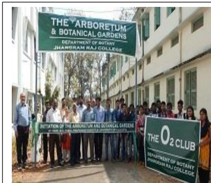
Arboretum & Botanical Gardens formation by the Dept. of Botany

For details, click on https://jrc.ac.in/departement/index.php?c=9&&v=9