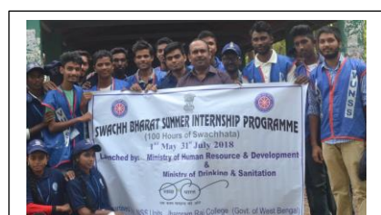
Swachh Bharat - Cleanliness Drive

The National Service Scheme is a central government scheme, under the Ministry of Youth Affairs and Sports. It was launched on the 24 th of September, 1969, with the aim of involving students in the task of national service. Keeping its motto of 'Not Me, But You' as its goal, the National Service Scheme of Jhargram Raj College has had a long tradition of volunteer activity by the students of the college. Today, there are four units of NSS operating under the