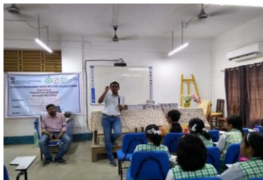
Outreach Programme under DBT Star College Scheme organised by Dept. of Zoology