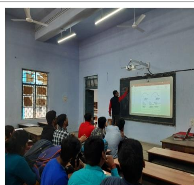
Departmental seminar organised by the Dept. of Chemistry