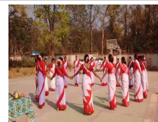
Bratachari Camp organised by the Dept. of Physical Education

For details, click on https://jrc.ac.in/department/index.php?c=15&&v=9