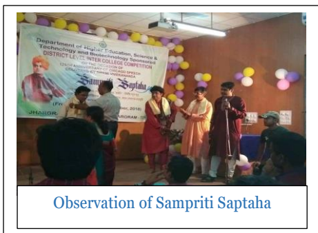
Observation of Sampriti Saptaha

Healthy cultural atmosphere of academic institutions are required for psychological upliftment and overall development of students. Such encouraging atmosphere allows expression of creative skills rests in each individual student. Teachers from different departments who show efficiencies in cultural activities regularly take part in conduction and overall supervision of various cultural programmes. Students of each of the department celebrate Teachers' Day, Fresher's Welcome and Farewell Ceremony of outgoing students every year. All of the departments are decorated up to its full. Students give their full efficiency to beautify their own departments and uplifting their performance to the