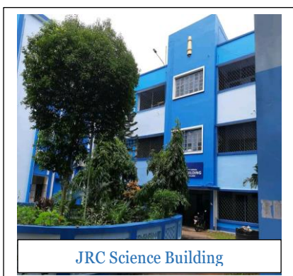
JRC Science Building