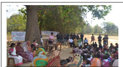
Special camp at Adopted Villages

Special camps. The volunteers actively participate in tree plantation and blood donation programmes, cleanliness drive, health awareness campaigns, special camps, social work at adopted villages etc. all around the year. The volunteers of these units are active participants in all these programmes and are well-trained to help the society at large. Jhargram Raj College is one of the most active colleges in the district with regard to the activities of the National Service Scheme, and during the crisis of Covid-19 in the year 2020, Jhargram Raj College has been nominated to be the nodal office in the District of Jhargram, to lead the crusade against Covid-19.