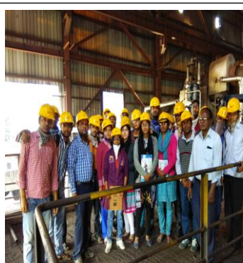
Educational trip organised by the Dept. of Chemistry