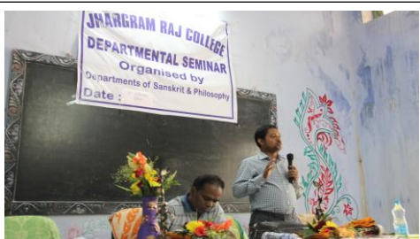
Departmental Seminar organised by the Departments of Sanskrit and Philosophy

The Department of Political Science started its journey in 1957. Political Science was taught as a pass subject at that time under the affiliation of Calcutta University. Political Science was started in 1969. However, the department came under the affiliation of Vidyasagar University in 1985 and the department now follows the CBCS pattern as per Vidyasagar University norms. The department has an enriched departmental library. Students can borrow books from the library. We have many students who had qualified NET/ SET examinations in later period. The department organizes for intradepartmental Students' Seminar and arranges for publication of departmental wall magazine every year. The Department also takes a leading role in preparing students for various competitions like Youth Parliament Competitions, inter-college quiz and debate competitions etc. on a regular basis. For details, click on https://jrc.ac.in/department/index.php?c=6&&v=9