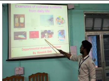
Departmental Student's Seminar organised by Dept. of Physiology

The Department of Physiology has a glorious history of progress since its inception in 1985. Physiology (General) and Physiology (Honours) were introduced in the years 1986 and 1995 respectively under the affiliation of Vidyasagar University. The success of the departmental endeavour is evident from significant academic performances of students in the university examinations. Most of the students have achieved success in many spheres of life and excel in various academic arena such as, schools, colleges, research laboratories, medical institutions etc. The department organizes for intradepartmental Students' Seminar, arranged for publication of departmental wall magazine every year. Excursion or field trip is not mandatory, but optional for this subject in CBCS curriculum. For details, click on https://jrc.ac.in/department/index.php?c=13&&v=9