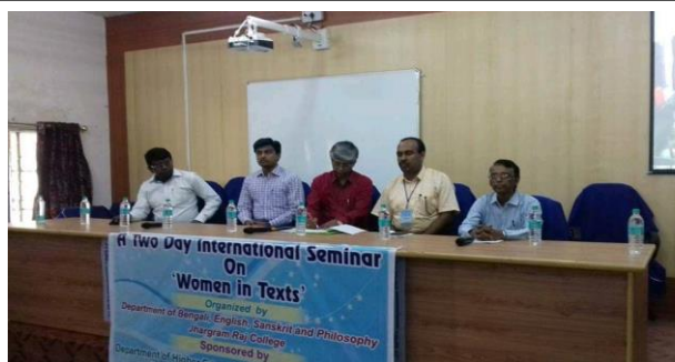
International Seminar organised by the Departments of Bengali, English, Sanskrit and Philosophy

For details, click on https://jrc.ac.in/departament/index.php?c=3&&v=9