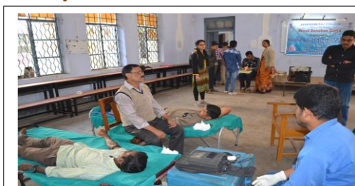
Blood Donation and Thalassemia Detection

guidance of the National Service Scheme Cell, Vidyasagar University, and the NSS Regional Directorate, Kolkata. Led by energetic Programme Officers, the NSS Units of Jhargram Raj College induct volunteers in their very first year of college, and they remain enrolled as volunteers till their final year of college. They are encouraged to take part in the calendar programmes conducted by the NSS Units, in the extension and outreach programmes conducted in the adopted villages, and also in special programmes held from time to time, such as week-long special