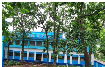
JRC Arts Building

In 2005, the college introduced its first Postgraduate course in Chemistry. Gradually, Postgraduate courses in Zoology and Bengali also came into being from 2006 and 2008, respectively. Jhargram Raj College, over time, grew into a hallowed centre of higher learning, offering to the undergraduate students a whole array of subjects from three disciplines of Arts, Commerce and Science. Different