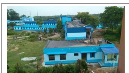
Aerial View of JRC Boys' Hostels

form to be obtained from the hostel office. Hostel accommodation is made strictly made according as per the existing norms. All boarders must abide by hostel rules and regulations and violation of the hostel rules are severely dealt with. Ragging is strictly prohibited. Any hostel boarder if found to be involved in ragging will be seriously dealt with as per revised Govt. norms.