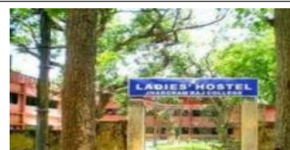
JRC Ladies' Hostel

HOSTEL ACCOMMODATION: The College provides separate hostel accommodation to boy and girl students. In fact, the college has three separate hostel buildings viz. Vidyasagar Chhatrabas, New Boys' Hostel and Girls' Hostel. The boys' hostel at present accommodates 220 boarders, while the girls' hostel accommodates 50 boarders. Application for hostel accommodation has to be made in the prescribed