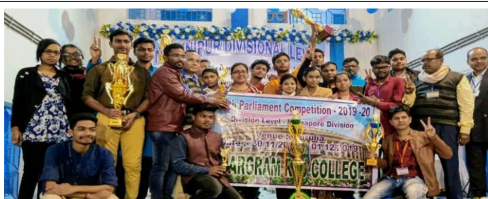
Winners of Youth Parliament Competition 2019-20 with the departmental teachers of the Dept. of Political Science