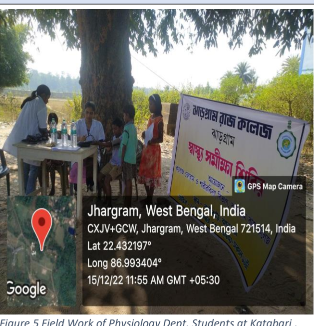
Figure 5 Field Work of Physiology Dept. Students at Katabari , Jhargram

Figure 4 Plant Identification - Practical Class of Botany Dept.