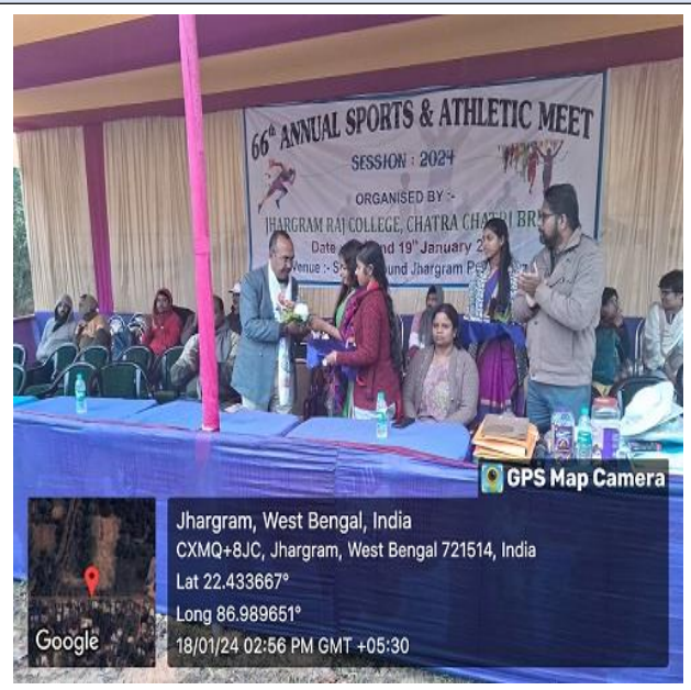
Figure 26 Annual Sports & Athletic Meet