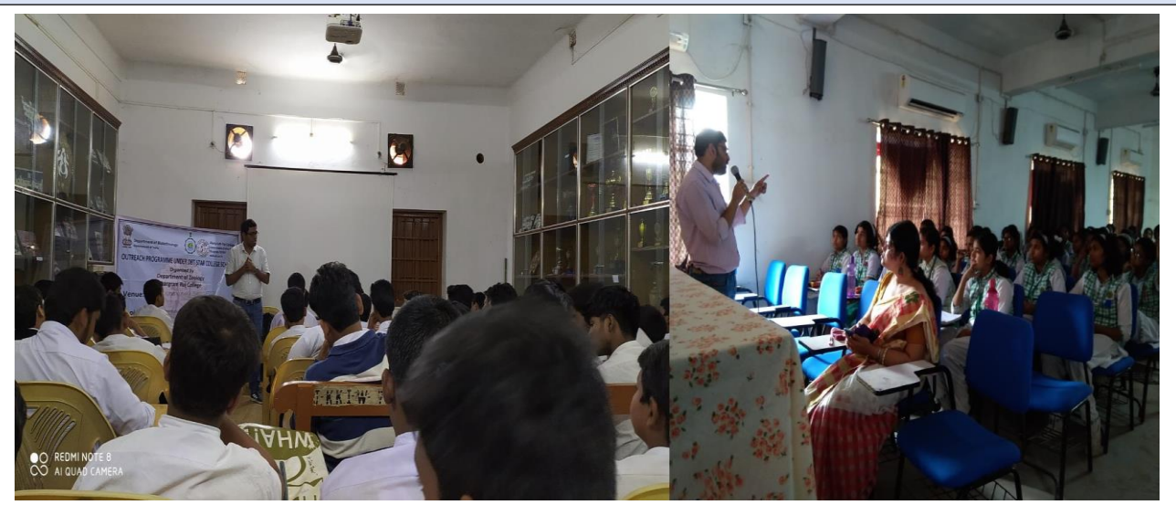
Figure 18 Outreach Programme of Zoology Dept. under DBT Star College Scheme