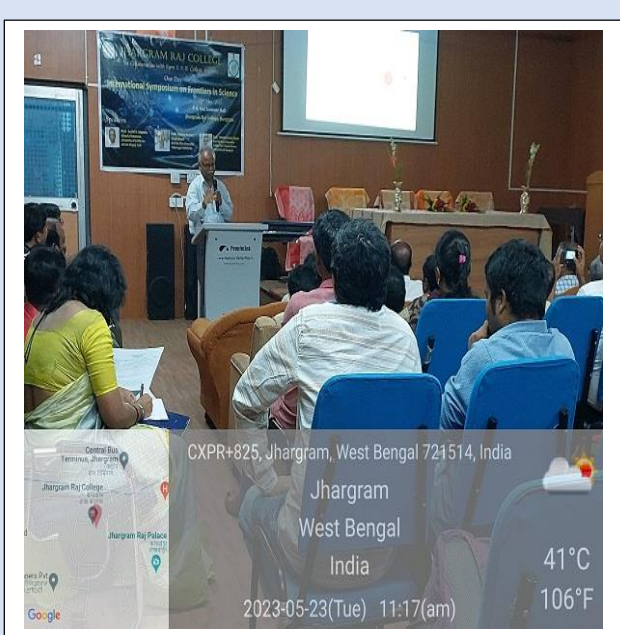
Figure 27 International Symposium on Frontiers in Science