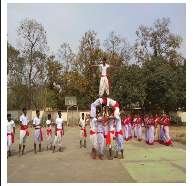
Figure 11 Bratachari Camp of Physical Education Dept.