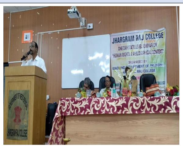
Figure 14 State-level Seminar on Human Rights organized by Philosophy Dept.