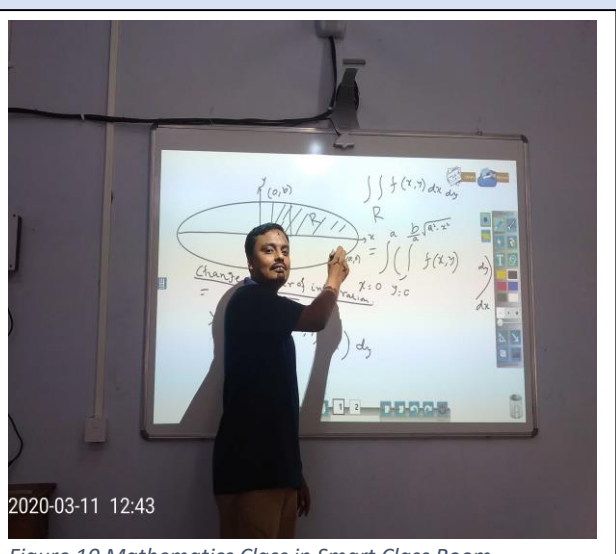
Figure 10 Mathematics Class in Smart Class Room