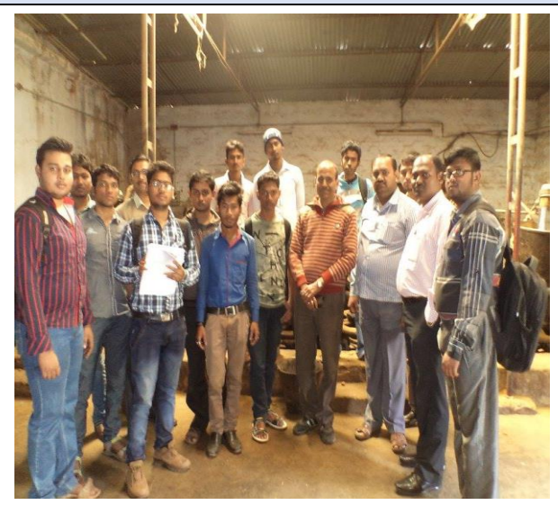
Figure 7 Industrial Visit of Commerce Dept.