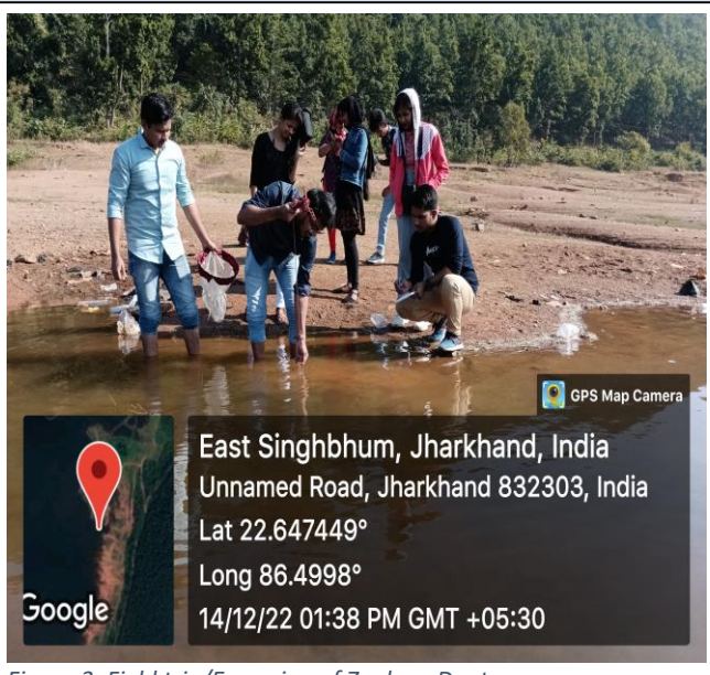
Figure 3. Field trip/Excursion of Zoology Dept