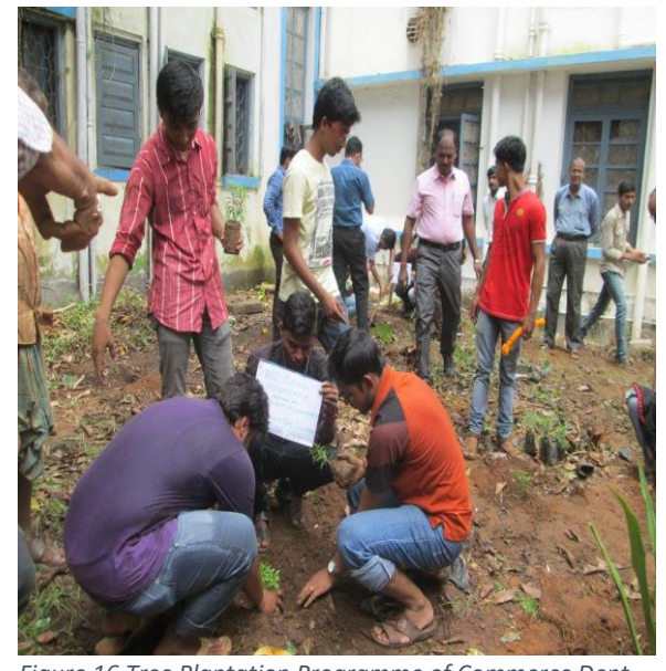
Figure 16 Tree Plantation Programme of Commerce Dept.