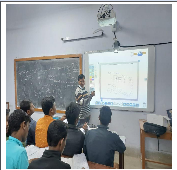
Figure 6 Physics Class in ICT enabled classroom