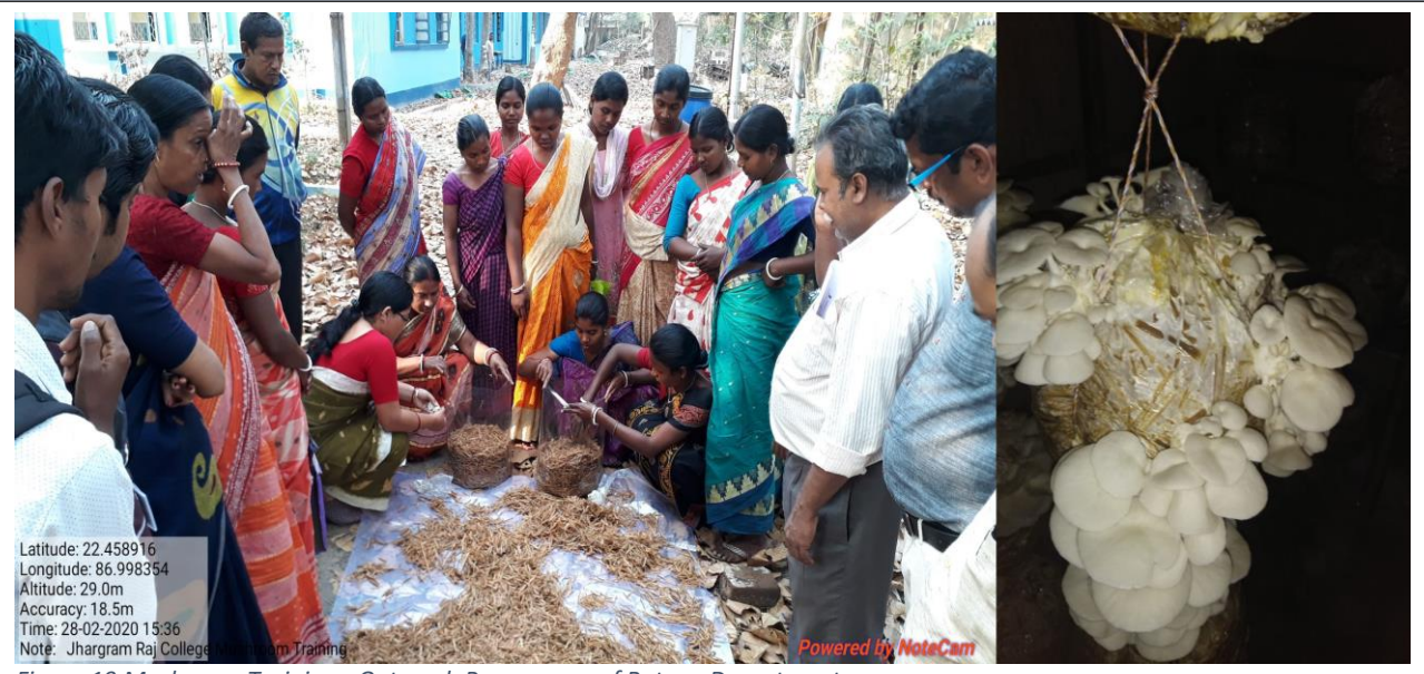
Figure 19 Mushroom Training - Outreach Programme of Botany Department