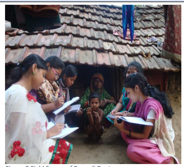
Figure 8 Field Survey of Bengali Dept.