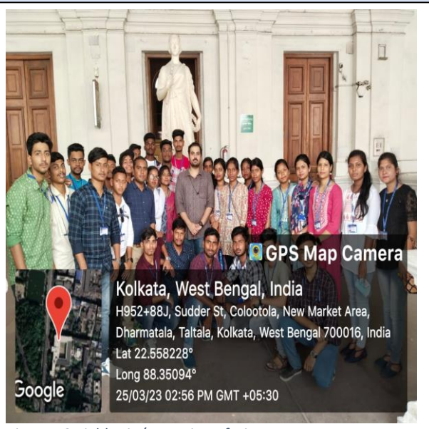
Figure 12 Field Trip/Excursion of History Dept.