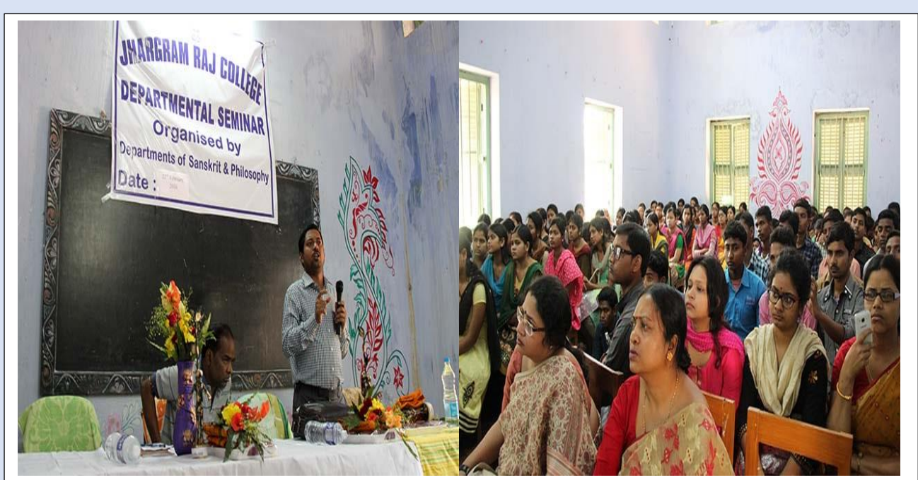
Figure 17 Departmental Seminar organised by Dept. of Sanskrit & Philosophy