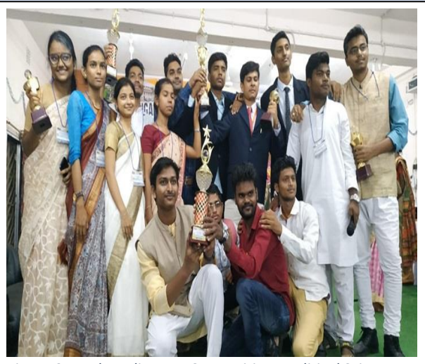
Figure 9 Youth Parliament Competition_ Political Science