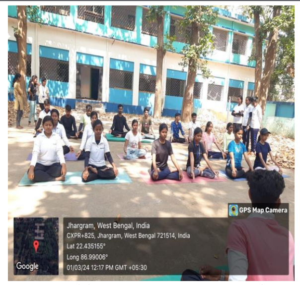
Figure 15 Workshop on Yoga & Stress Management by Philosophy & Physical Education Dept.