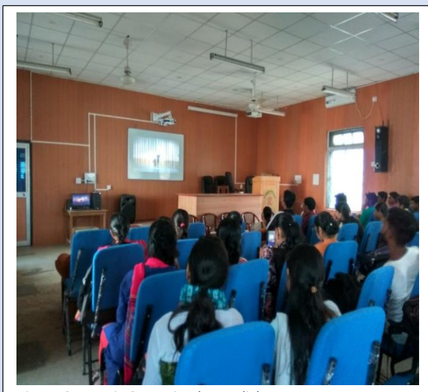
Figure 21 Movie Screening by English Dept.