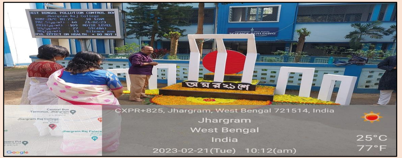
International Mother language day Celebration