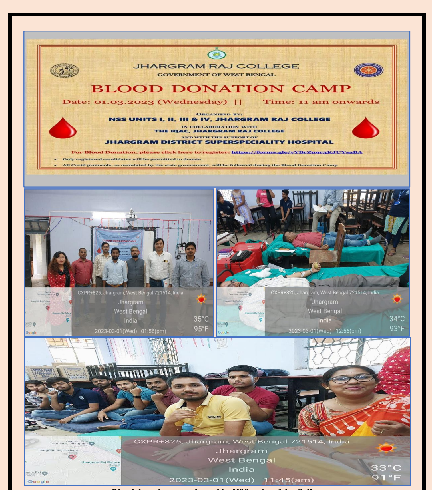
Blood donation camp hosted by NSS units of the College

Sensitization of students and employees to the constitutional obligations: Values, Rights, Duties & Responsibilities