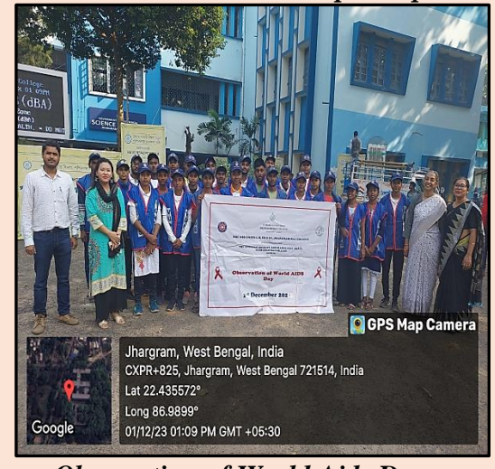
Observation of World Aids Day

Active participation of Students in Youth Parliament Competition