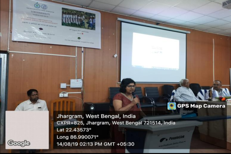
Observation of College foundation day