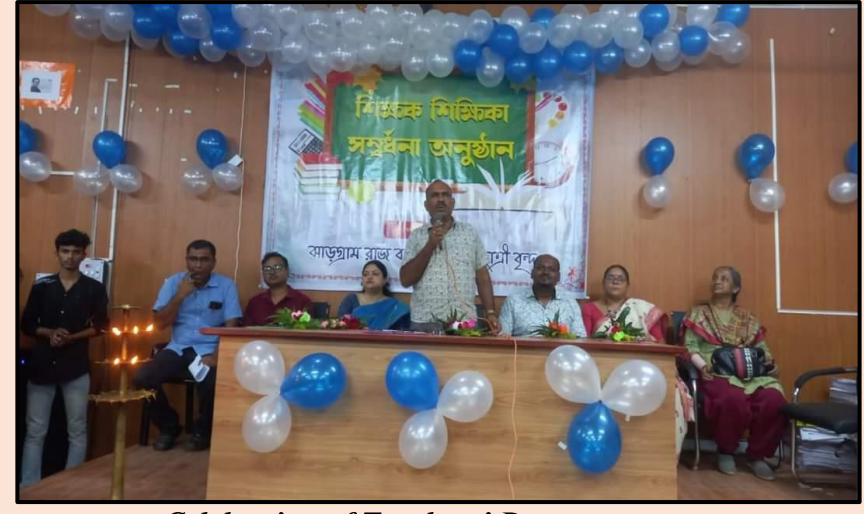
Celebration of Teachers' Day

Sensitization of students and employees to the constitutional obligations: Values, Rights, Duties & Responsibilities