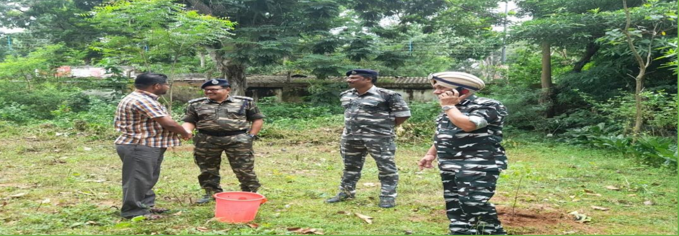
Tree plantation programme by NSS units & Alumni Association of the college