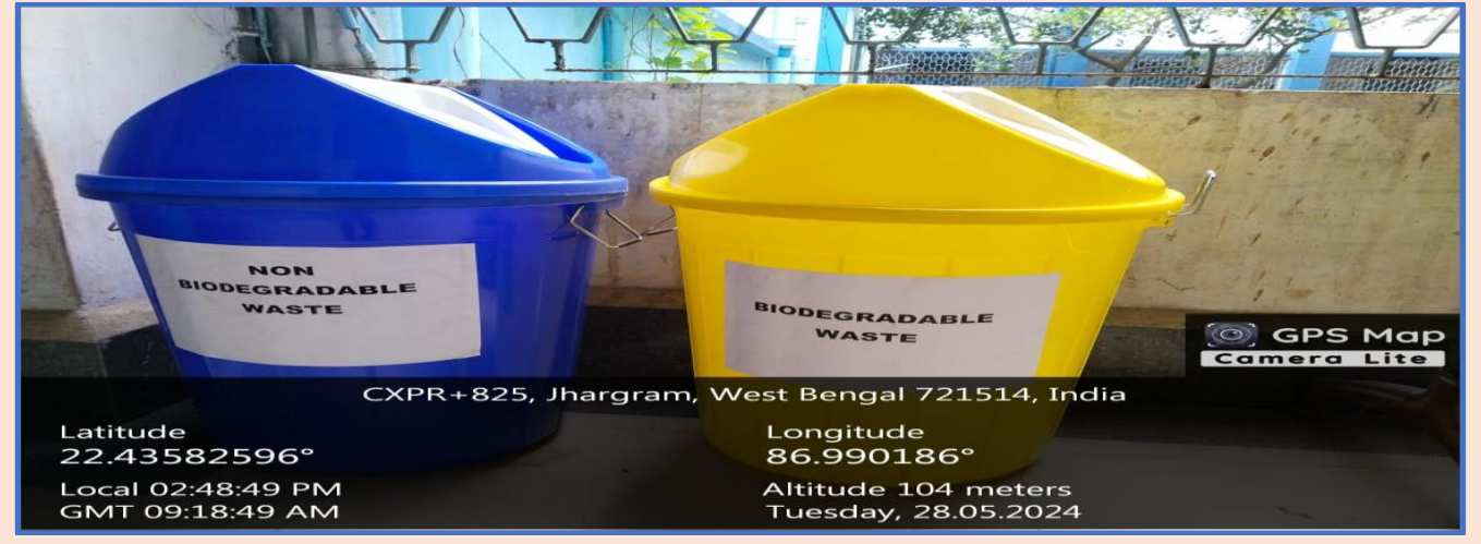
Segregation of biodegradable & non-biodegradable waste