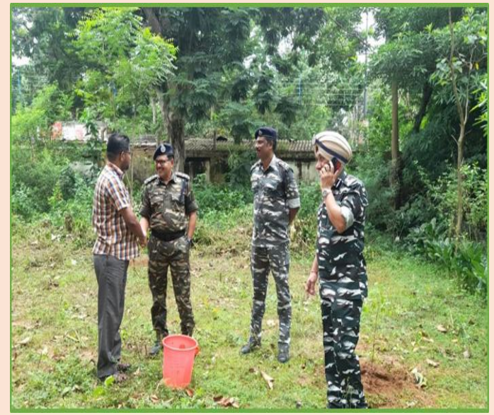
Tree plantation programme