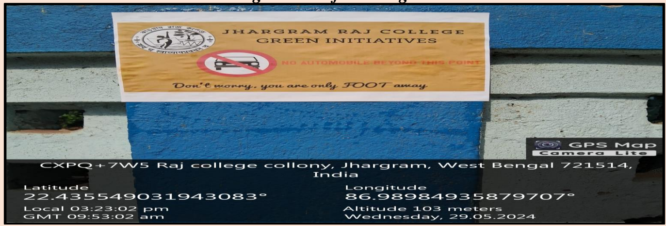
Sign board of automobile restriction