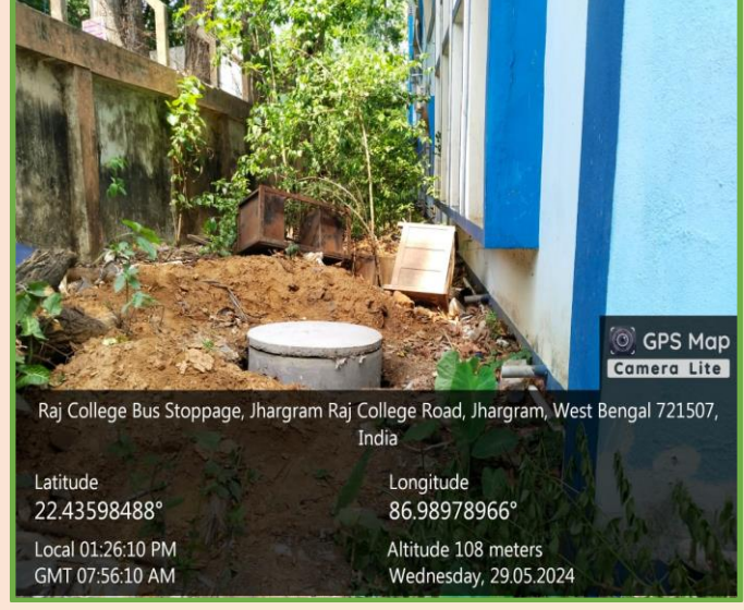
Chemical Waste management