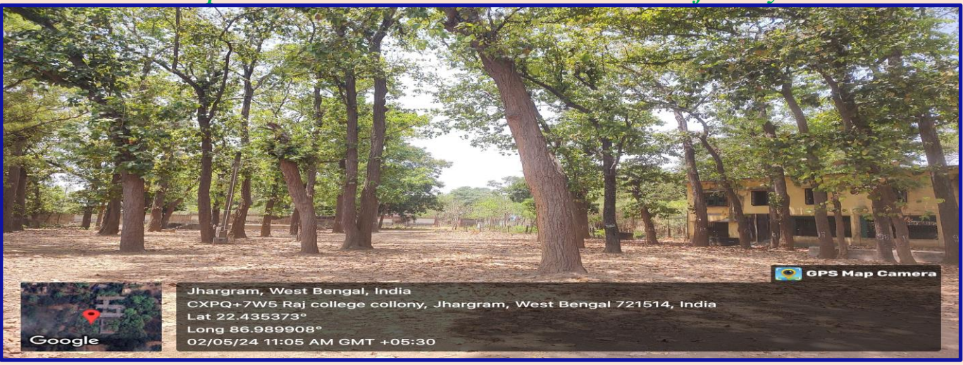
Sal plantation inside campus