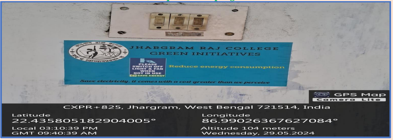
Sign board for reducing energy consumption