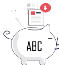
Transfer of Credits