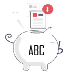
Transfer of Credits