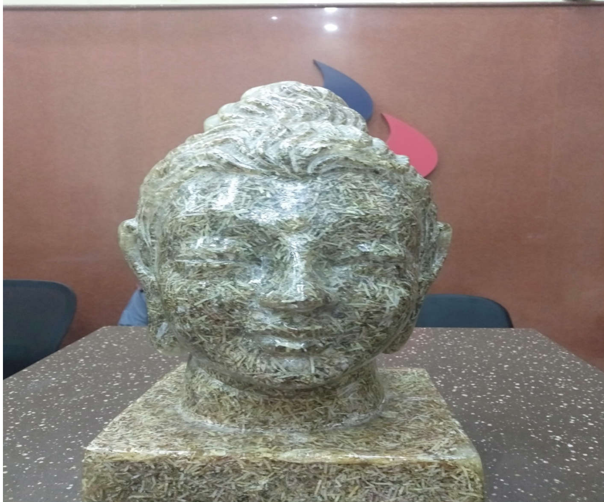
Image of Buddha made of Soiled Notes